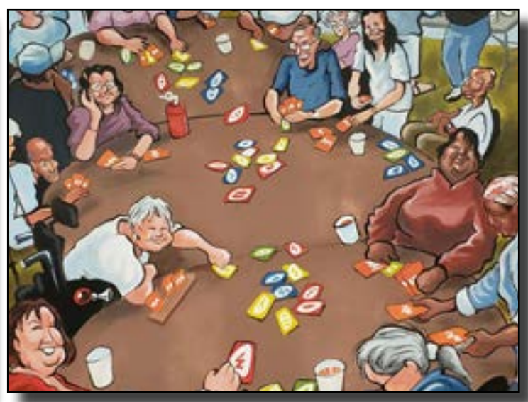
Senior Hot Shots with Friends