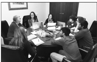
GMU team with a caregiver (left)