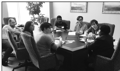
W&M team with a caregiver (right)