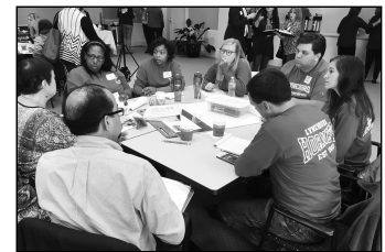
Lynchburg College team with a caregiver

The team representing Lynchburg College was awarded the competition's $5,000 Grand Prize, for “ Visible Me ,” an app that enables caregivers to log their self-care activities in order to redeem points. These points nourish a virtual garden, or care for a virtual pet, which is symbolic of the caregiver's own wellness. By taking care of themselves holistically and nourishing their body, caregivers will allow their garden to flourish, just as their own health will through tracking their self-care progress via the app.